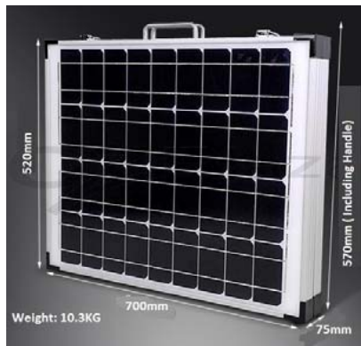
2*45W Folding Kit

This Solar Panel is made of high efficient and produces the smallest solar cells. Employed the cutting edge technology, the unique advanced textured cell surface reduces the reflection of sunlight and maximise light absorption. The Solar Panel delivers outstanding performance even in the challenging environment, including low light condition and cells being partly shaded. It also features tempered glass covering for hail resistance, and resisting steel ball falling down from 1m high.